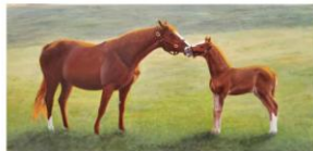
Kathy Petz Fine Art

Thank you to our sponsors for contributing to the success of our 31st Annual Fall Show and Sale