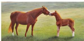
Kathy Petz Fine Art

Thank you to our sponsors for contributing to the success of our 31st Annual Fall Show and Sale